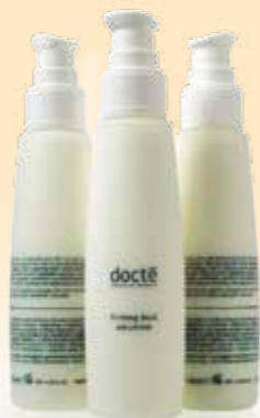
Survey shows Palmitoyl Oligopeptide is able to reduce surface roughness by 17%, lightens wrinkles by 23-39% and increase skin thickness by 4%.